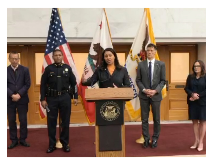
San Francisco Mayor London Breeed conducts a press conference to discuss shelter in place orders.

The Bay Area Joint Information System is a network of individuals with responsibilities to support emergency public information and warning. Members from a broad spectrum of agencies, disciplines, and jurisdictions throughout the Bay Area work together